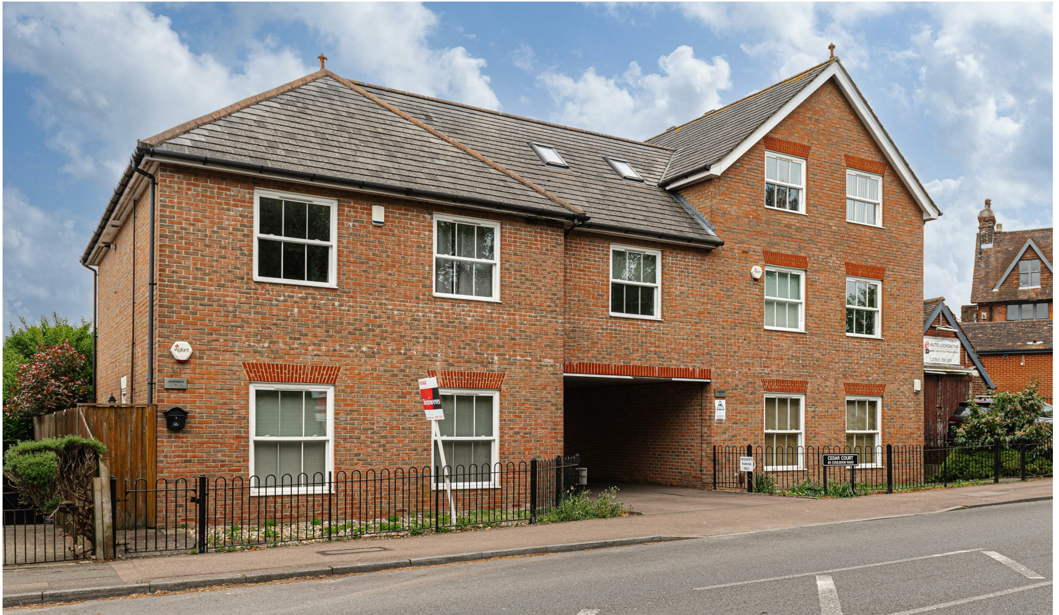
Coulston Road, Caterham £325,000